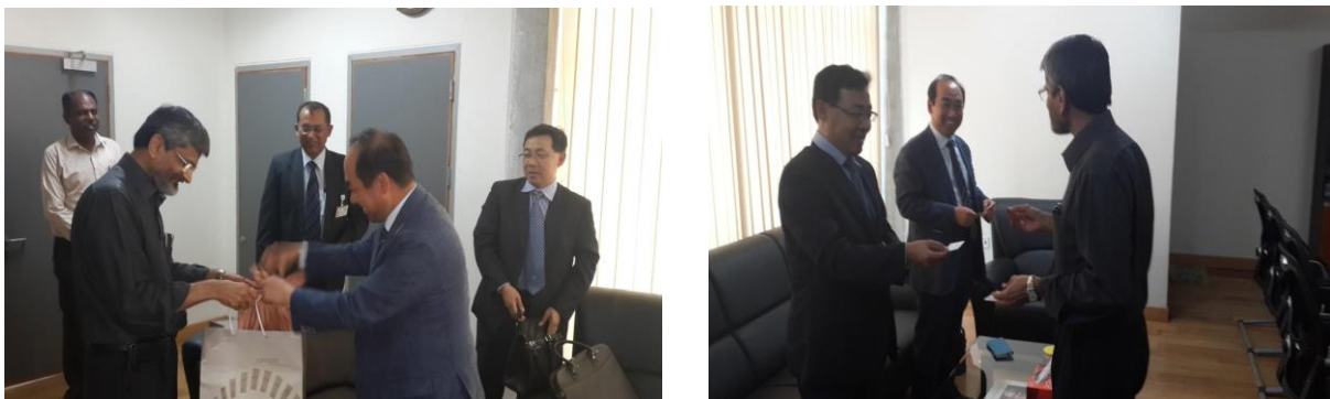
Collaboration and Handshaking

The course at the Samsung Digital Academy covers subjects such as OS Kernel, Application Framework, Graphics, UI, Multimedia, Connectivity, Web, and IoT centric developments. Technical talks, industry expert’s lectures/demonstrations, major/minor projects, and technical contests, all form a part of the student course at the Samsung Digital Academy.