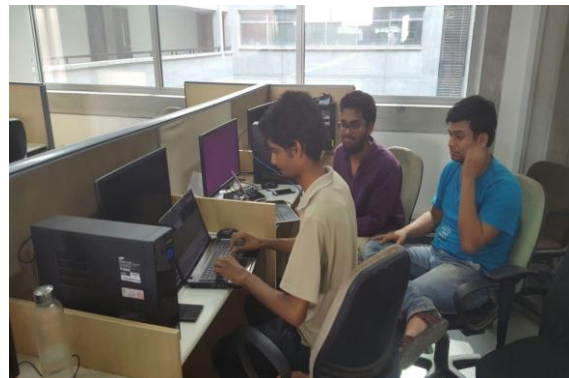
Pervasive Computing Lab – IITH Students Working on Hands-on Experiments