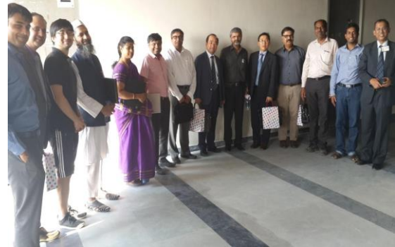
Samsung Digital Academy Team at IITH