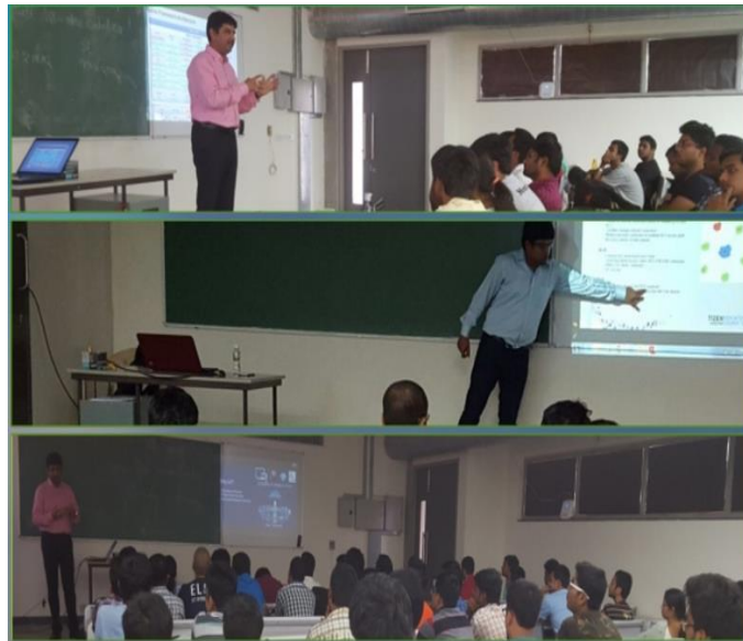
Pervasive Computing Lab – Technical Talks by Experts from SRI-Delhi